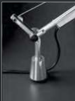
Desk fixed support