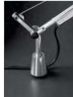
Desk fixed support