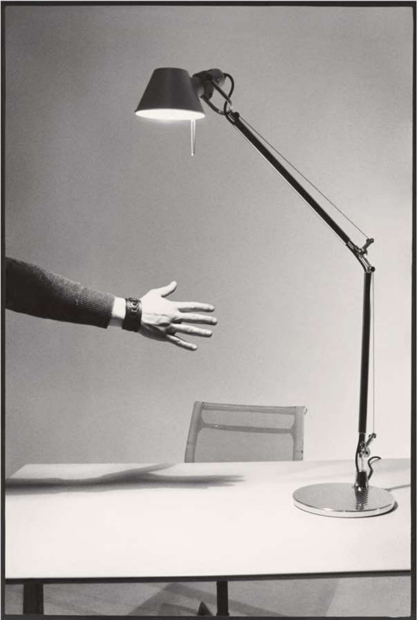
Elliott Erwitt, 2015