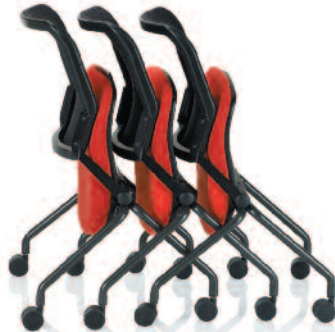
Torsion Air® AF cool | contemporary | comfortable Designed by Giancarlo Piretti