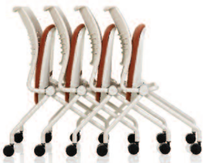
Strive® AF versatile | comfortable | affordable Designed by Giancarlo Piretti