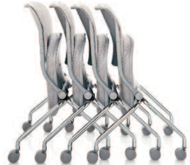
Torsion on the Go!® AF convenient | comfortable | durable Designed by Giancarlo Piretti